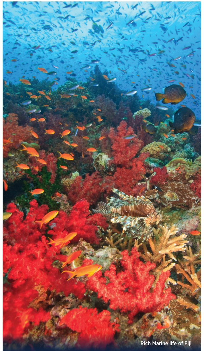
Rich Marine life of Fiji

The itinerary is a guide only and may be amended for operational reasons. As such Mayflower & Scenic cannot guarantee the tour will operate unaltered from the itinerary stated above. Please refer to our terms and conditions for further information.