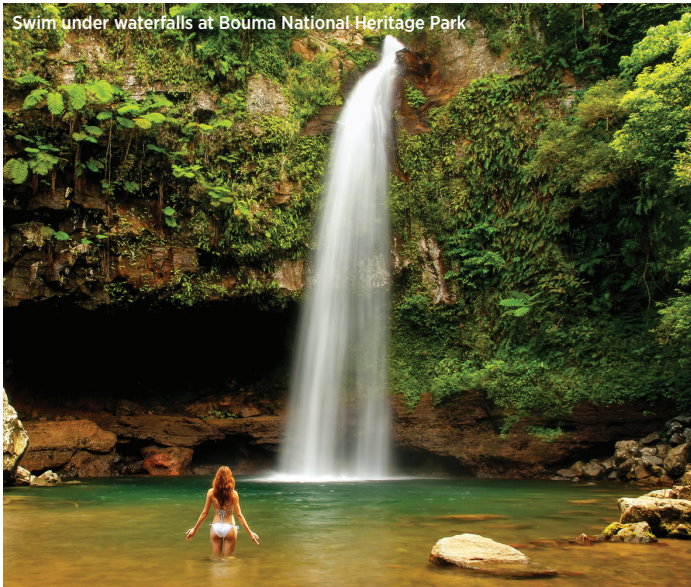
Swim under waterfalls at Bouma National Heritage Park